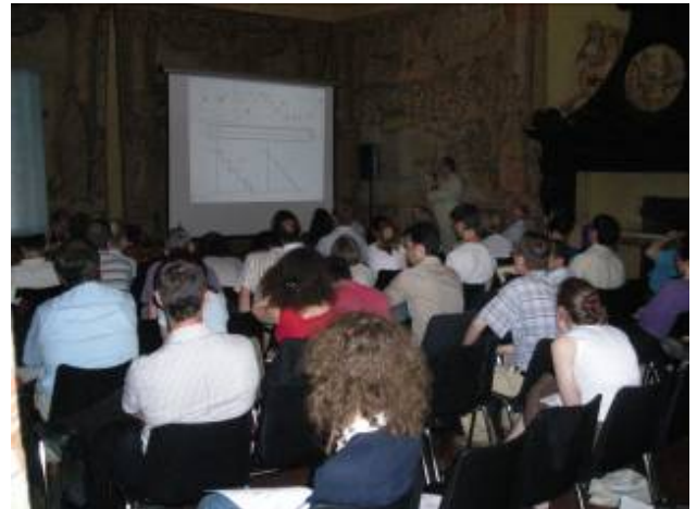
Training course lecture

There was a broad mix of attendees, with approximately half coming from Measuring the Impossible projects and the rest being researchers and students from relevant scientific disciplines. Nine different Mtl projects were represented in total. The programme included a general theoretical and methodological section, giving important background across a range of topics, and a section where selected application areas were presented, such as sound perception.