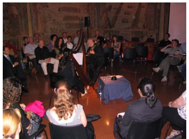
Evening concert at the Palazzo del Principe

The presentations given at the training course will be made available on the MINET website soon. To gain access you must be registered as a member of the e-MINET network.