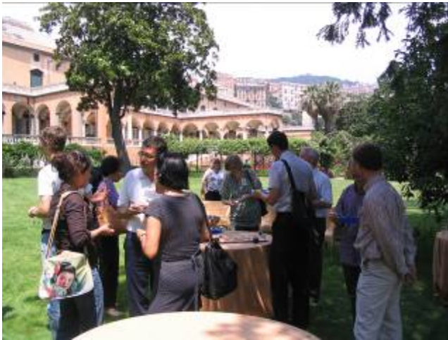
Attendees enjoying lunch

The 19 lectures were presented by experts in the various fields of scientific research of relevance for Mtl projects, and researchers from the FUGA (Fun of Gaming) project set up a demonstration that gave attendees the opportunity to gain some practical experience.