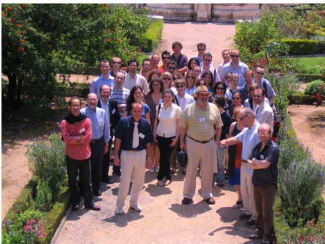
Some of the training course participants

Two highly enjoyable evening social events took place. The first was a dinner in the old port area of Genova, and the second was a concert and a tour of and dinner in the XVI century Palace.