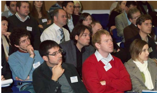
Some of the conference delegates

It included 19 oral paper presentations and 14 poster presentations, from both Mtl and non-Mtl projects and research groups.