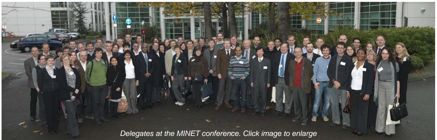
Delegates at the MINET conference. Click image to enlarge

A social dinner was held at the Twickenham Rugby Ground, photos of which can be viewed here .